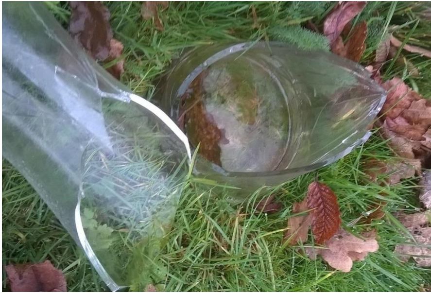
An example of unauthorised, hazardous memorabilia